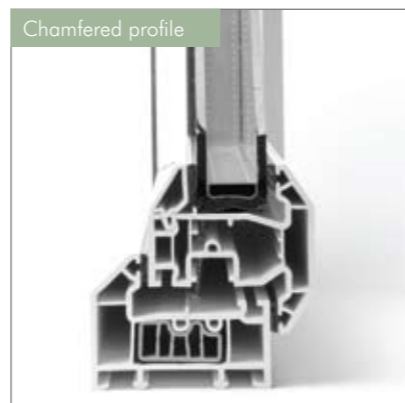
Shown with thermal sleeve insert.